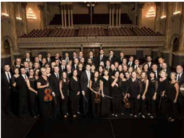
Adelaide Symphony Orchestra