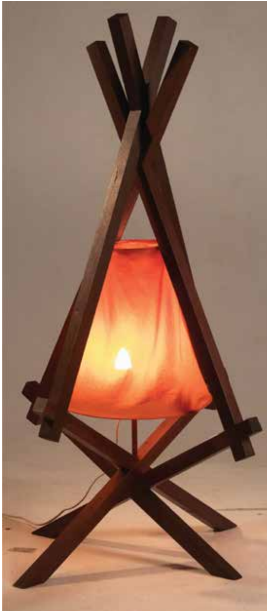
Jared Garfoot Lamp