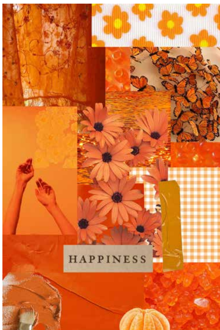
Lillee Wakefield Happiness, 2023 Digital collage