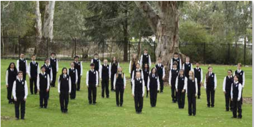
The Marryatville Concert Choir