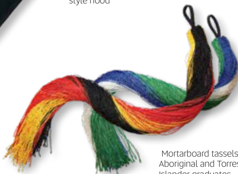
Mortarboard tassels for Aboriginal and Torres Strait Islander graduates