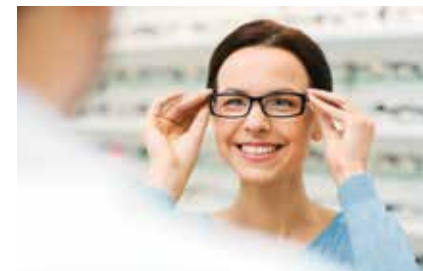
Bupa Optical Stores

We're more than just a health insurance provider. We also offer a broad range of health clinics and aged care homes in your area.