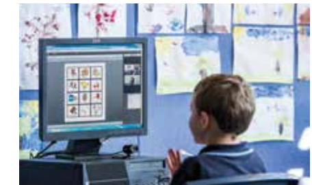
Bupa Health Foundation

To find out more, visit bupa.com.au/aged-care