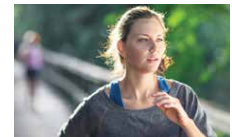
Bupa Health Insurance

Call 134 135 or visit bupa.com.au/other-insurance