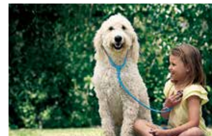
Bupa Pet Insurance

To find out more, visit bupa.com.au/foundation