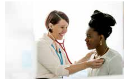
Bupa Medical clinics

Visit a Bupa Hearing clinic, hearing.bupa.com.au