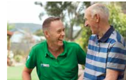
Bupa Aged Care

Visit a Bupa Medical clinic, bupa.com.au/medical/gp