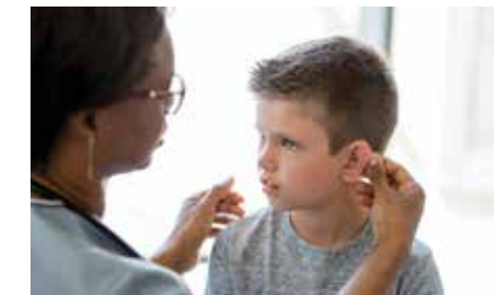
Bupa Hearing clinics

Visit our 130 Bupa owned Members First dental clinic, or bupa.com.au/dental