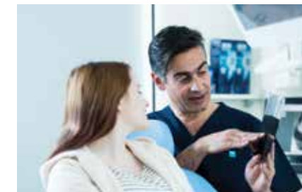
Bupa dental clinics

Visit a Bupa Optical store, bupaoptical.com.au