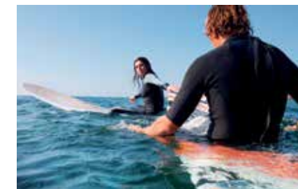
Bupa Travel, Home, Car, Life Insurance

Call 134 135 or visit bupa.com.au/pet-insurance